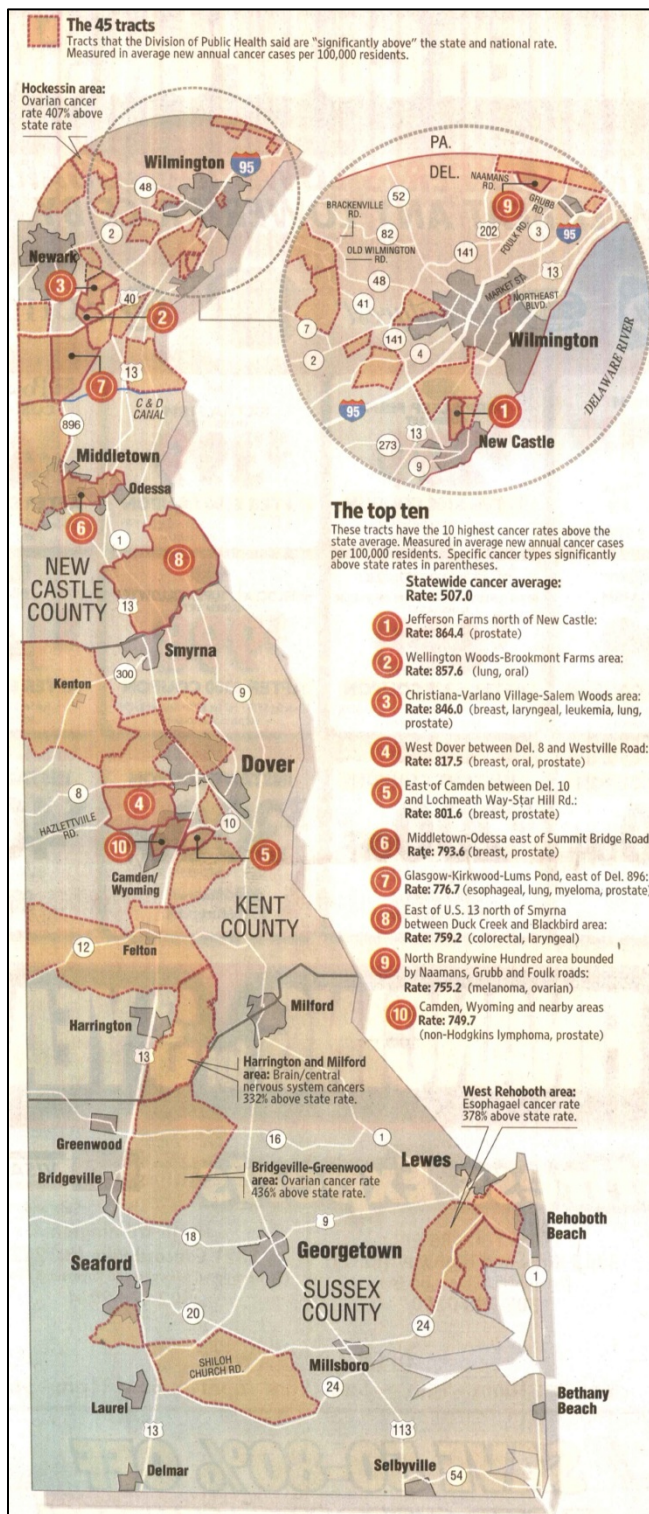
Figure 1. From The News Journal , September 12, 2010 © Gannett. All rights reserved. Used by permission and protected by the Copyright Laws of the United States. The printing, copying, redistribution, or retransmission of this Content without express written permission is prohibited. http://www.delawareonline.com/